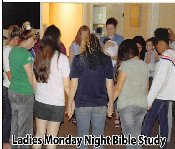
Ladies Monday Night Bible Study

During the week we offer various devotional times to help our residents experience the love of God, and grow in the knowledge of Him and His ways. These are times when our people find more purpose and direction in life... and more peace and joy.