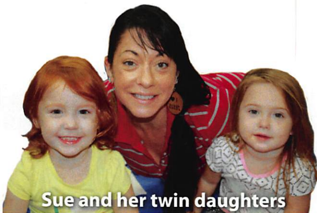
Sue and her twin daughters